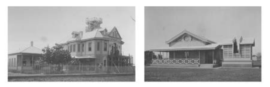
Figures 2 and 3 - The meteorological and astronomical buildings of the Campos Rodrigues Observatory, 1908

After some initial setbacks, time signals started to be sent regularly, via the telegraphic network, to a clock installed in the boarding area of the port. The signals were also relayed to a system of luminous semaphores that displayed the time in the freight area. This arrangement replicated the system of public time signals that Oom had saw at the Hamburg port. It was eventually adopted in Lisbon as well.<sup>20</sup>